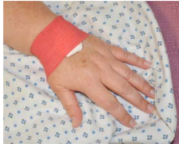
Exhibit 2. Red Coban Indicating Blood Culture Taken

The use of a simple visual cue, followed by improved communication between nurses and laboratory staff, helped the hospital improve its performance on the pneumonia care core measure related to blood culture prior to antibiotic administration. The hospital's scores on this measure had lagged because it was not always apparent to nursing staff whether a blood culture had